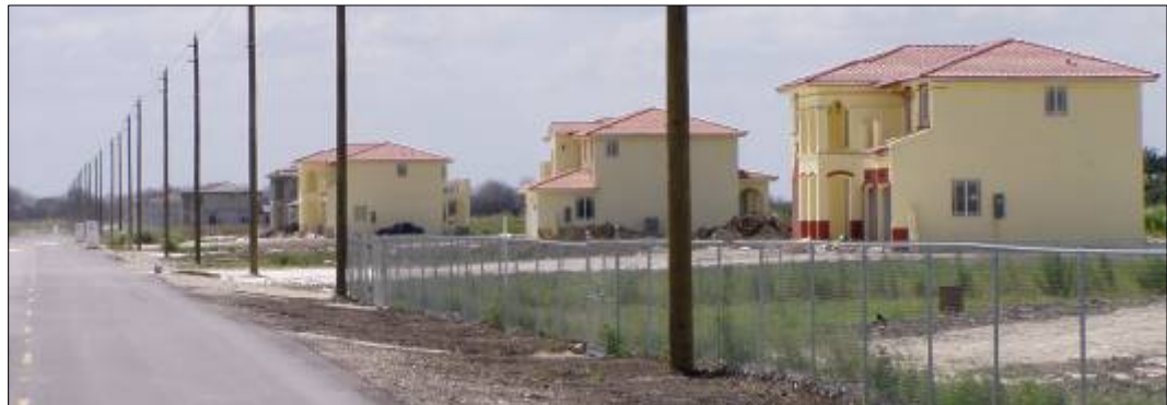
Example of one unit per five-acre residential development currently occurring in Miami-Dade County outside the 2005 Urban Development Boundary

The consequence of not having land to accommodate demand is causing unplanned and inefficient development outside the UDB. Illustratively, there are currently 900 acres of land along the levee in the vicinity of S.W. 104 th Street being developed as a subdivision of 5-acre lots. Certainly, this development, which can occur "by right", is not consistent with the belief of some opponents of boundary expansion that the area west of the boundary should be used solely for agriculture. It also represents an inefficient use of land because it will provide shelter for only 190 households. Finally, it will negatively impact the quality of life of people within the boundary in terms of the demand it will place on infrastructure. Most notable in this regard is the fact that residents of these homes will send their children to schools within the boundary. While they will pay school impact fees, they will not be required to pay the mitigation fees required of newly zoned projects inside the boundary that impact schools operating at utilization rates in excess of 115 percent of FISH.