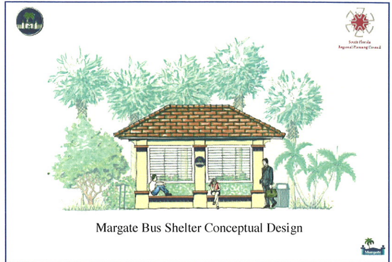
Margate Bus Shelter Conceptual Design

The City of Margate Community Redevelopment Agency (CRA) approved the conceptual designs that Council Staff presented for a custom bus shelter that will be constructed on State Road 7 in Margate. The shelter pictured below is the product of a grant that the CRA received for transportation enhancements through the State Road 7 Collaborative for improvements along the corridor. The shelter will also incorporate the solar powered real-time signs that Broward County Transit (BCT) uses to inform riders of headway times. Together with BCT and the City of Margate Transportation Department, Council Staff is also identifying locations and funding sources for future shelters throughout the city. For more information about the design contact Brian Traylor of council staff BTraylor@sfrpc.com , or visit the Margate CRA website: www.margatecra.org .