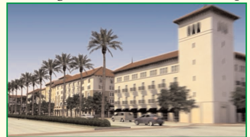
Conceptual view of West Park

It is hard to believe that it has been almost two years since work on The State Road 7/U.S. 441 Collaborative Strategic Master Plan began. The federal funding secured by U.S. Congressman Alcee Hastings with the assistance and support of the South Florida Congressional Delegation is being used to create a roadmap to a brighter future for the 16 local jurisdictions that abut State Road 7 in Broward County. Their Strategic Master Plan will help guide economic development and redevelopment efforts, pedestrian safety and transportation improvements, and beautification efforts along the corridor. Through its work, The State Road 7 / U.S. 441 Collaborative has become a regional, state, and national model of how to meaningfully engage community stakeholders in redevelopment.