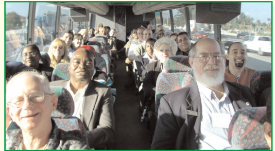
Tour participants having fun!

On January 21, 2005, the State Road 7 Community Network sponsored a "Sense of Place" Bus Tour to Abacoa, West Palm Beach, Delray Beach, and Boca Raton. The tour included elected officials, redevelopment professionals and Community Network members from Broward and Miami-Dade Counties. The tour demonstrated how urban infill development with a focus on urban design has been implemented in these communities. Participants learned how each of these jurisdictions use urban design as part of their redevelopment strategy to bring significant economic and physical improvements to the corridor.