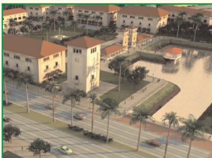
Entranceway into Parkland

Key to the development of the Master Plan is the development of community visioning plans. The community visions help to identify the specific needs of the community, including regulatory reform, schools, infrastructure, landscaping, transportation, lighting, and public-safety features.