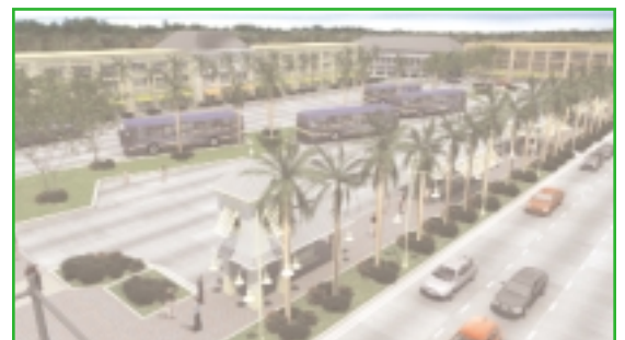
Supporting Transit Solutions

The Collaborative's Master Plan identifies over $300 million in public transportation and infrastructure investments that will be needed to support this level of economic development. The Collaborative is actively seeking local, state and federal financial assistance to support future redevelopment activity. Implementing the Master Plan is now our mission.