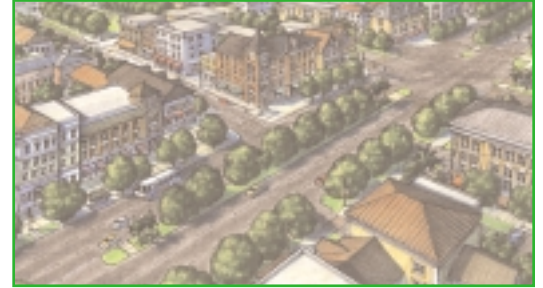
Creating Walkable Communities

It is hard to believe that it has been almost two years since work on The State Road 7/U.S. 441 Collaborative Strategic Master Plan began. The federal funding secured by U.S. Congressman Alcee Hastings with the assistance and support of the South Florida Congressional Delegation is being used to create a roadmap to a brighter future for the local jurisdictions that abut State Road 7. Their Strategic Master Plan will help guide economic development and redevelopment efforts, pedestrian safety and transportation improvements, and beautification efforts along the corridor.