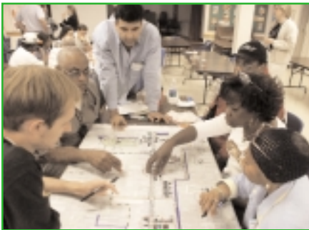
Seeking Citizen Input

Key to the development of the Master Plan is the development of community visioning plans. The community visions help to identify the specific needs of the community, including regulatory reform, schools, infrastructure, landscaping, transportation, lighting, and public-safety features.