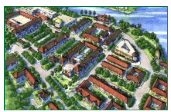
The Waterfront Street: A Reason to Visit Margate

awarded $250,000 to the Collaborative to support the development of the SR 7 Community Network to a c t i v e l y engage elected officials, citizens, community-based organizations, faith-based organizations, civic leaders, and the private sector in the State Road 7 revitalization process.